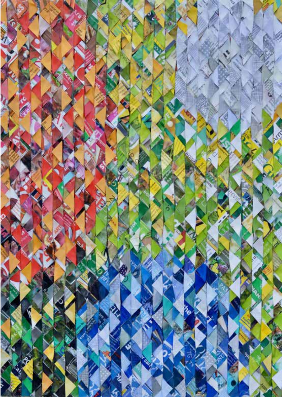
Love in an Age of Anger , 2018 junk mail on canvas, finished with resin 18 x 24 inches